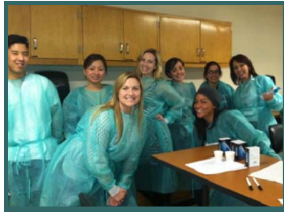
Our proud Dental Hygiene students

ViziLite, which when illuminated with a special light, indicates potentially cancerous lesions.