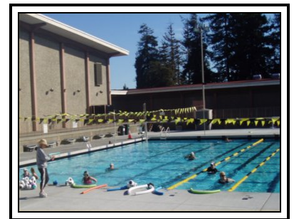
Chabot's Renovated Olympic Size Swimming Pool