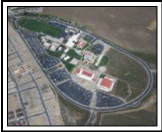
Campus Aerial View

another highlight of the new buildings tours.