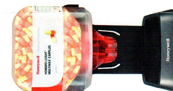
Roll over image to zoom in

Back to search results for "honeywell howard light multimax earplug"